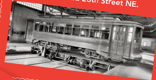
DC Car Barn, 1932

A Car Barn serves as an operations and maintenance building. Streetcars are inspected, cleaned and when needed, repaired in the Car Barn. It also provides a training center, community space, and offices. The Car Barn will be located at Benning Road and 26th Street NE.